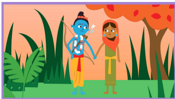
Rama and Sita - the story of Diwali