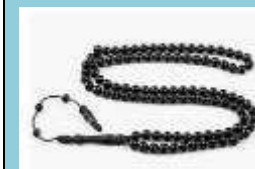
subha (prayer beads)