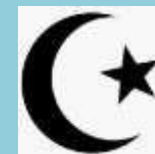
star and crescent Mosquesymbol of Islam