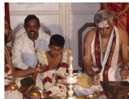
• The ultimate goal of Hindus is to achieve Moksha, which is freedom from the cycle of reincarnation